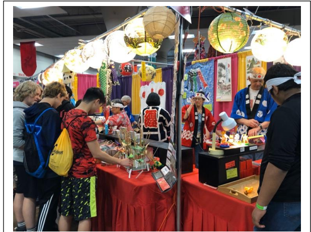
TCJACL at our last Festival of Nations booth 2019

*time has been requested but not yet assigned. We will only have a single booth this year