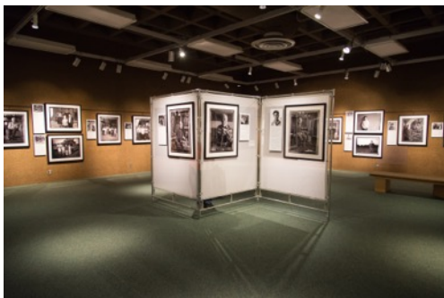
"Gambatte! Legacy of an Enduring Spirit: Japanese American WWII Incarceration, Then & Now" exhibition at Historic Fort Snelling on opening night, May 23, 2017

"Gambatte!" is on display at the Historic Fort Snelling Visitors Center, 200 Tower Avenue, St. Paul, MN through Saturday, October 28, 2017, during Visitor Center hours, and is free and open to the public. Accompanying programs are being held in conjunction with the exhibition (see elsewhere in the Rice Paper for schedule).