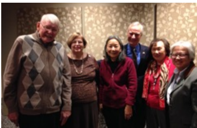
Networking with other Japanese American associations, December 11, 2015