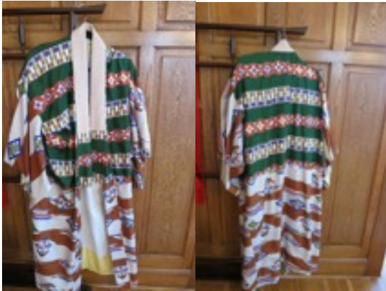
Item #24 antique silk kimono (dry cleaned but small spots) (donated by C. Nayematsu) Value $30