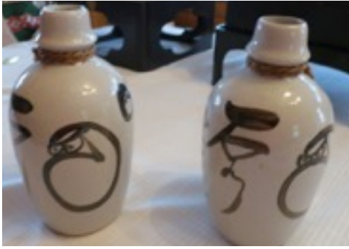
Item# 35: Pair sake decanters , 8 1/2 " H x 13 1/2 "circumference, donated by Jean Takeshita Value $20