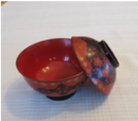
Item #27 red and black lacquer soup bowl (donated by P. Jokull) Value $10