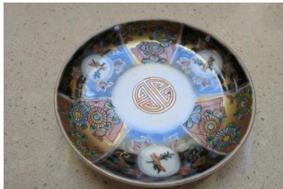
Item # 2: round Imari style porcelain dish 5" circumference (donated by P. Jokull)