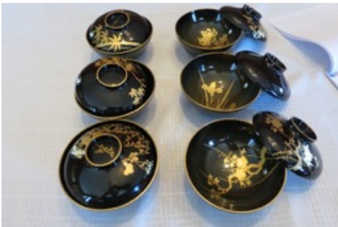
Item# 17: 6 black and gold lacquer soup bowls with lids—each bowl has a unique design with matching lid (donated by L. Platt) Value $150