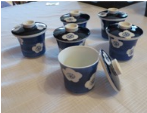
Item #37 six blue and white chawan mushi porcelain cups with lids, 3" H x 9 3/4" W donated by J. Takeshita Value $40