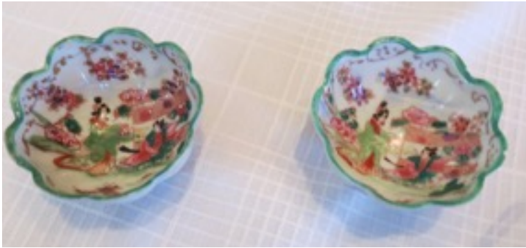
Item #21: 2 two miniature porcelain bowls 3"x2" H (small chip in one) (donated by C. Nayematsu) Value $8