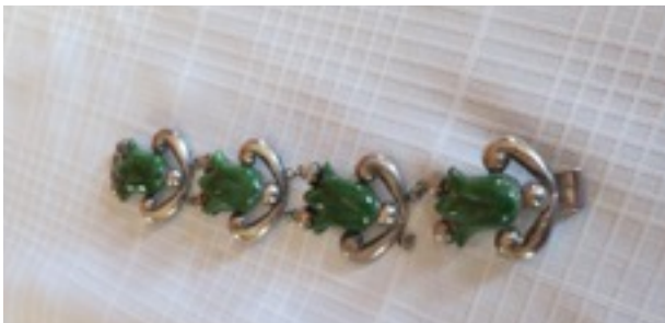
Figure #30 jade bracelet (1 loose link) (donated by L. Platt) Value $20