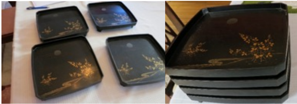
Item # 4: four black and gold stackable lacquer trays, 9 ½ “ square, 1 ¾” H (donated by P. Jokull)