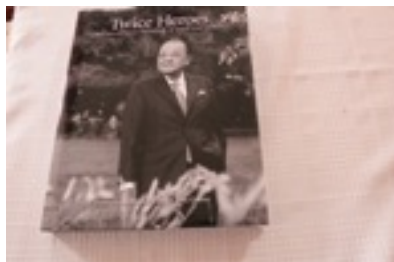
Item #42: Twice Heroes: America's Nisei Veterans of WWII and Korea.