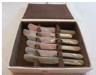
Item #41 six mother of pearl butter knives in beautiful silk case (donated by L. Platt) Value $25