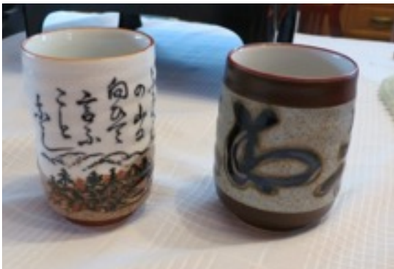
Item # 36: pair tea cups approximately 4 1/2 " H x 10" circumference donated by J. Takeshita Value $10