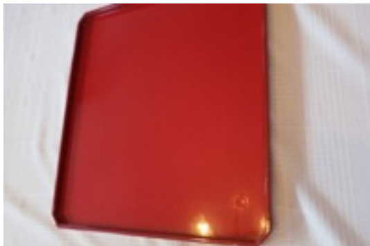
Item # 7 red lacquer tray 14 1/4" square, (in original box (donated by P. Jokull) Value $40