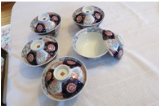
Item #25 5 donburi bowls with lids (donated by P. Jokull) Value $40