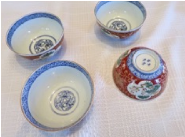
Item# 16: 4 imari (has possible imari marking on bottom) style rice bowls (donated by P. Jokull) beautiful red with pine trees. Value $30