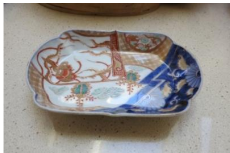
Item# 3: Japanese Imari style porcelain dish 7" x 4.5" x 1 3/4" (donated by P. Jokull)