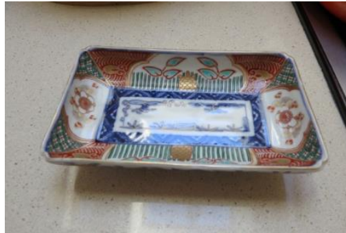
Item #1: rectangular Imari style porcelain dish 8" x 4.5" x 1 3/4" (donated by P. Jokull)

(Note: Estimated values listed. Feel free to submit your best offer.)