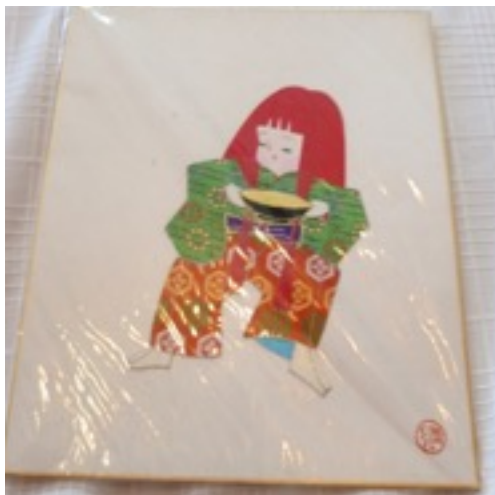
Item # 6 kime komi ningyo picture, 10 3/4” x 9 ½” (donated by C. Nayematsu) Value $15