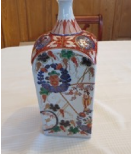
Item #26, vase 12" H x 4 5/8" W (donated by P. Jokull) Value $40