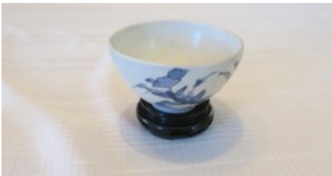
Item #18 blue and white ceramic bowl and stand—appears old (donated by P. Jokull) Value $40