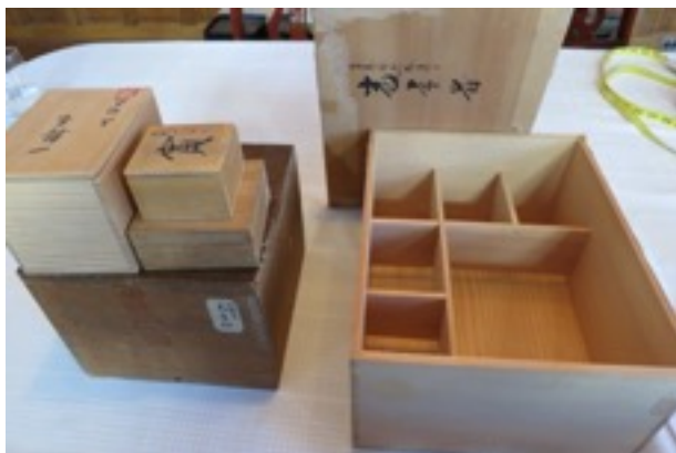
Item #11 Assorted Wooden boxes (all empty) Value $5