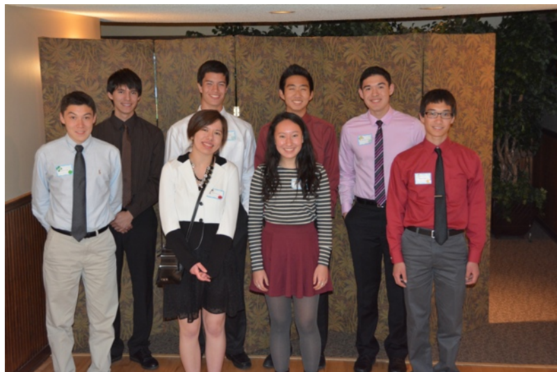
Twin Cities JACL 2014 local senior high school (HS) scholarship awardees.