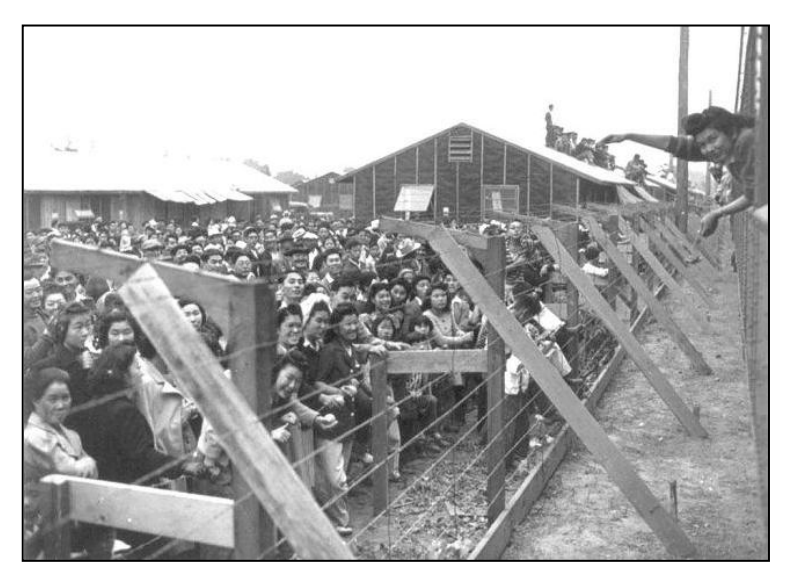
Japanese Americans behind the barbed wire fence in Santa Anita Race Track, a temporary detention center, waving goodbye to friends leaving by train for other incarceration camps. (Photo from National Archives).

When many Japanese and Japanese Americans were initially forced to leave their homes, they were directed to live temporarily in "assembly centers"—officially "Wartime Civil Control Administration" camps. (The WCCA was essentially a branch of the U.S. Army.) These make-shift detention facilities were often crudely fashioned from animal stalls at racetracks and fair grounds, still emitting the stench of animal waste but surrounded by barbed wire and search lights with armed soldiers to contain the people of Japanese descent. The euphemistic nature of this term hid the degrading lack of amenities and very crude living spaces in these facilities. For example, on December 18, 1944, Supreme Court Justice Owen J. Roberts