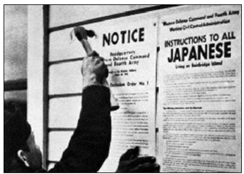
Soldiers and police posted President Roosevelt's February 19, 1942 Executive Order #9066 requiring the expulsion of Japanese Americans from the West Coast. Posters included euphemisms like "evacuation" and "Assembly Centers".

Pursuant to E.O. 9066. notices of military zones were publicly posted, which defined where Nikkei could be or not be present, along with special curfew hours prohibiting freedom of movement from dusk to dawn (see Fig. at right). Within weeks there followed public instruction notices telling people of Japanese ancestry that they had less than one week to dispose of their property and belongings (except for a short list of portable personal items) and prepare for an indefinite leave. These 'evacuation' notices directing 'nonaliens' to 'assembly centers' by a target date, seemed innocuous for what they really were, namely: federal orders to American citizens for their forced removal from private homes to government detention facilities and on