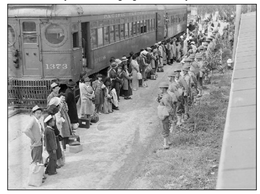
Japanese Americans from San Pedro, California, guarded by soldiers arrive at Santa Anita Racetrack, a temporary detention center, in Arcadia, California, in 1942.

perceptions about the forced removal of Japanese American citizens from their West Coast homes to desolate American concentration camps further inland. The public was told that Nisei and Issei (non-citizens) were being "evacuated" to "relocation centers" and "internment camps." Terms like "evacuation" of people sounded like they were being rescued from some kind of disaster (like an earthquake). To obscure the unconstitutional nature of these forced removals, the government referred to the Nisei victims as 'non-aliens' instead of 'citizens', which might provoke public inquiries like: "Why is the U.S. imprisoning citizens' without due process of law?" Once in camp,